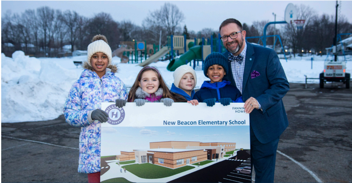
Beacon Elementary School Groundbreaking

Thanks to strong community support, Hilliard City Schools is moving forward with important facility improvements that will serve students and families for decades to come.